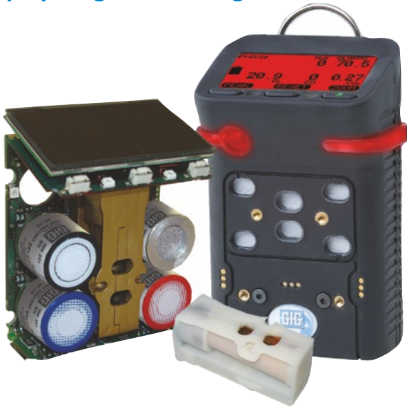
Figure 2: Changes in humidity from one day to the next as well as exposure to certain contaminants can affect the output of gas detecting sensors in fresh air.

Dead-bands may reduce user concerns because of trivial fluctuations in the instrument readings, but they may also leave the user unaware of changes as the instrument initially begins to respond to increasing concentrations of gas. Even worse, when the instrument starts out from a negative output level, it takes that much more gas before the instrument reaches the alarm concentration. For instance, if the LEL alarm is set at 10% LEL, when instrument starts out at -3% LEL it will take 13% LEL gas to cause the instrument to go into alarm. When the display is digitally locked on zero the user is unaware of the need to fresh air zero adjust the instrument.