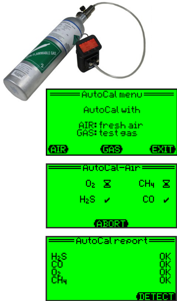
Figure 4: GfG instruments can be automatically fresh air zeroed or calibrated by means of a simple "AutoCal" procedure, (press "Air" to make an automatic fresh air zero adjustment, "Gas" to make a span calibration adjustment, or "Exit" to return to normal operation).

Make sure the instrument is located in fresh air, that the sensors are fully warmed up, and that the readings are stable. Continue to pay attention to the fresh air readings. If readings continue to count downwards it may be necessary to repeat the fresh air zero procedure.