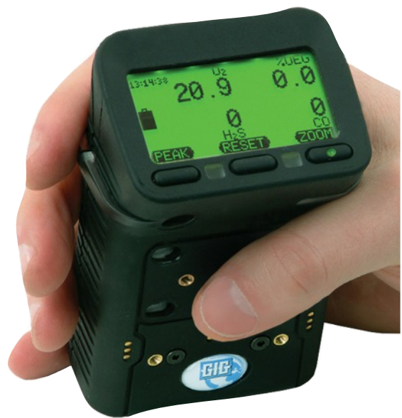
Figure 1: Always allow all of the sensors installed in your instrument to stabilize completely in fresh air BEFORE making a fresh air zero adjustment

GfG does NOT digitally lock LEL or toxic gas readings near zero!