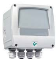
Mains unit in wall housing