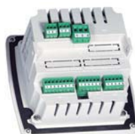
Mains unit in wall housing