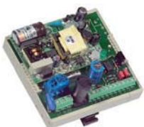
Mains unit on DIN rail