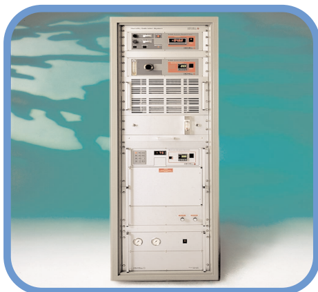
DCS Dew Point Calibration System

An integrated system for the calibration and characterisation of dew-point sensors and instruments