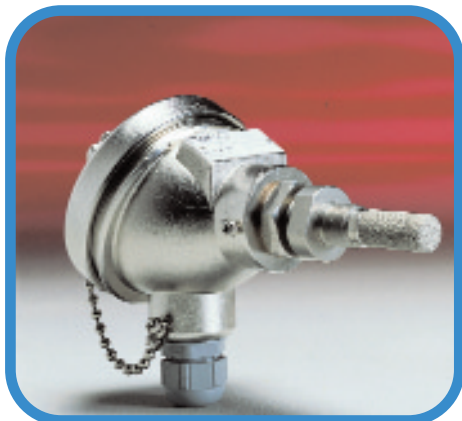
Transmet IS Dewpoint Transmitter

For continuous dew point measurements in hazardous areas, Transmet IS is the ideal transmitter solution with local measurement and certified intrinsically safe design